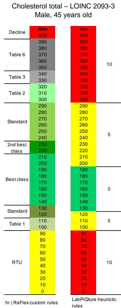
Exhibit 2 – hr | ReFlex rules versus LabPiQture score

Exhibit 2 illustrates this for a 45-year-old male applicant with LOINC 2093-3 for total cholesterol. The range of underwriting outcomes spans from refer to underwriter (RTU) to decline and includes best and preferred classes. Compared to the standard LabPiQture score of 0-5-10, in which 25 percent of applicants have a score of zero and 75 percent have a score of either 5 or 10 that would be declined or RTU, the hr | ReFlex Select rules enables an automated decision on the LOINC results 100 percent of the time. These decisions mirror a traditional underwriting thought process as they are aligned with the hr | Ascent underwriting manual.